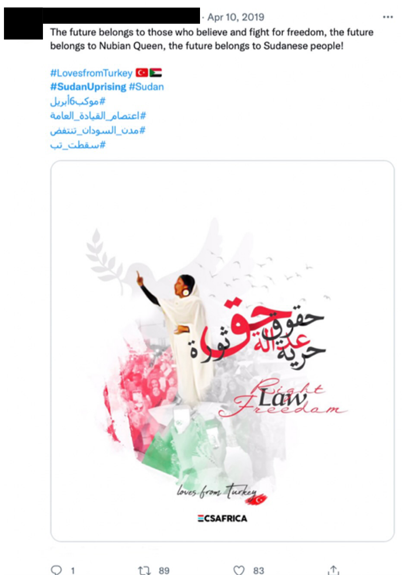
Figure 2: Example of a collage depicting Alaa Salah as a symbol of freedom

On the other hand, the graffiti in Figure 3 makes a textual and visual reference to the Statue of Liberty, linking Alaa Salah's political values to those attributed to the national monument. Thus, it reads "liberty is not a Statue anymore SHE is alive with flesh and blood". By using the capitalized personal pronoun "SHE", which refers to Alaa Salah as a woman, the creator merges the values associated with the Statue of Liberty, such as freedom and justice in Western culture, with the image of Alaa Salah. The graffiti was created by a group of Syrian