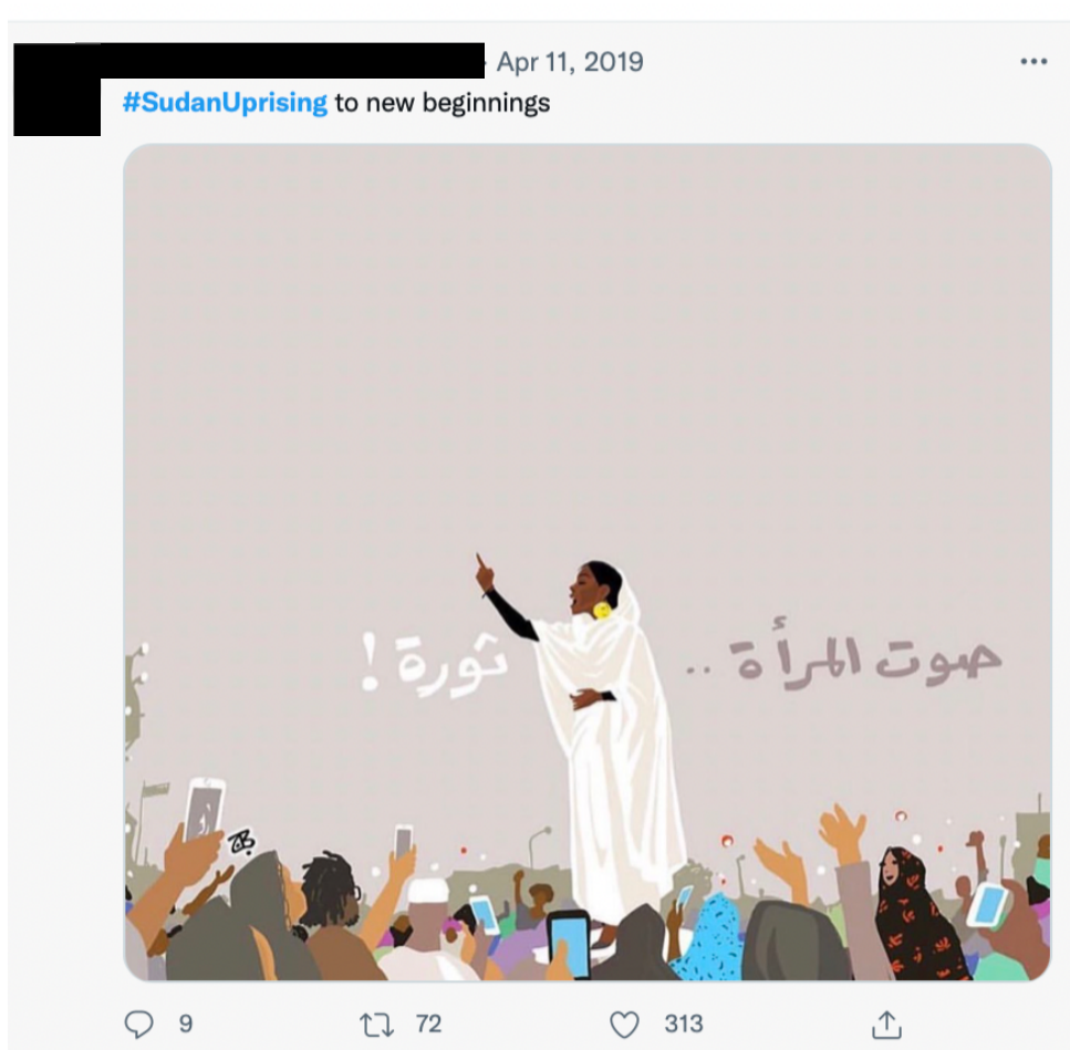
Figure 9: Digital illustration representing Alaa Salah as the voice of the revolution

gender, hairstyle, or clothing depicted are indicators of the cultural identity of the country. In correlation with the central message of the image, this shows that all Sudanese are contributing to this new dawn against the oppressive regime.