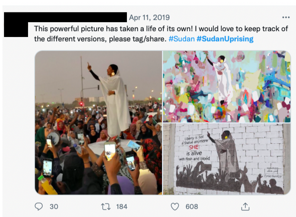
Figure 4: A single Tweet with multiple images of Alaa Salah

Figure 4 is a form of tweet with different versions of Alaa Salah. The producer recognizes the “powerful” values of the image and places a painting next to the graffiti associating Alaa Salah with the Statue of Liberty. Although there is no reference to “freedom” in the painting, the vibrant colours and abstract nature of the image communicate a very peaceful and hopeful feeling that distances itself from the violence and oppression in the country.